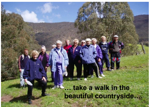
... take a walk in the beautiful countryside....