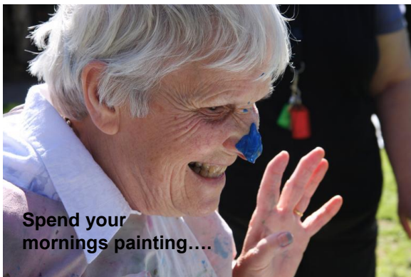
Spend your mornings painting....